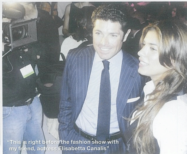
"This is right before the fashion show with my friend, actress Elisabetta Canalis"