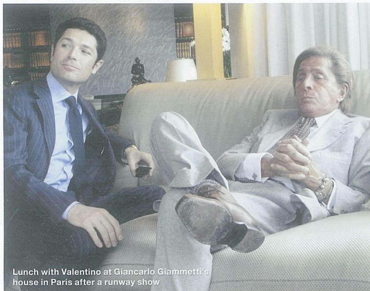
Lunch with Valentino at Giancarlo Giammetti's house in Paris after a runway show