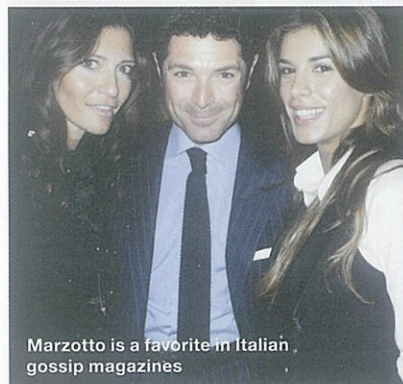
Marzotto is a favorite in Italian gossip magazines