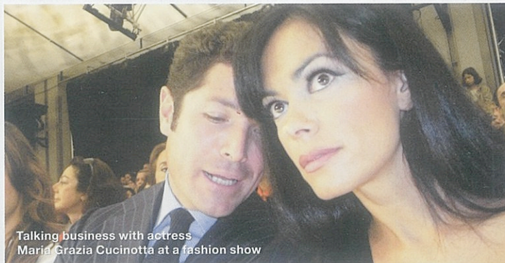
Talking business with actress Maria Grazia Cucinotta at a fashion show