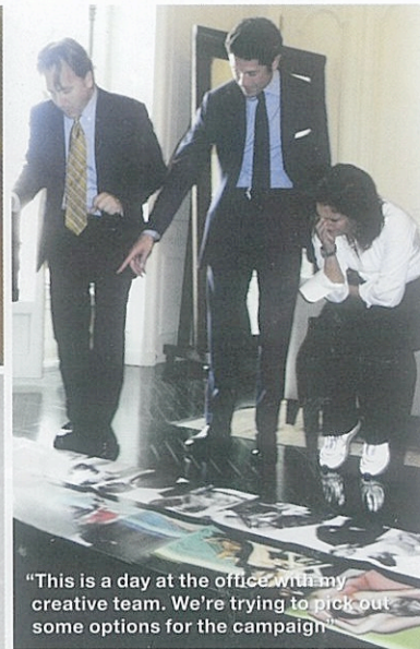
"This is a day at the office with my creative team. We're trying to pick out some options for the campaign"