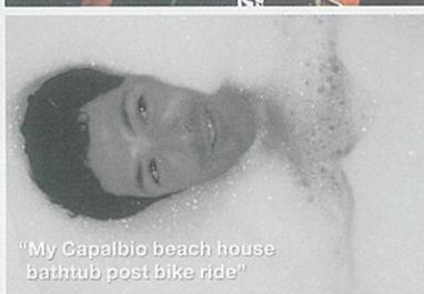
"My Capalbio beach house bathtub post bike ride"